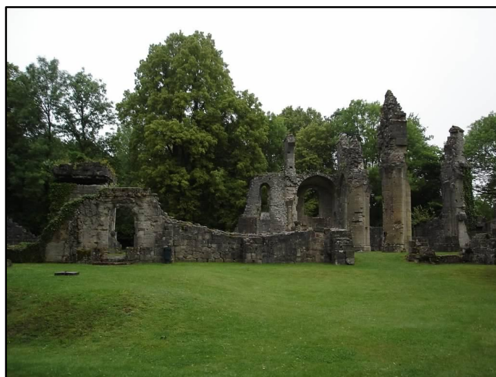
The ruins of Montfaucon Church by Kevin Drake, 2007