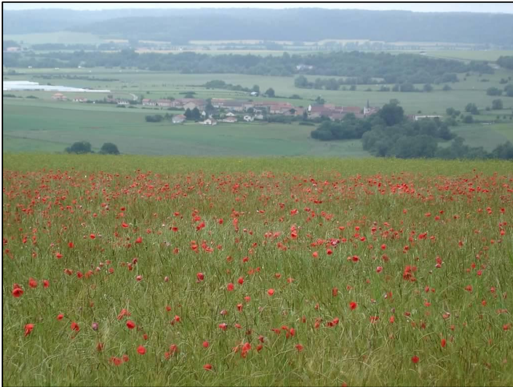
View from Hattonchâtel in the St. Mihiel Salient by Kevin Drake, 2007

Walking the battlefields of World War 1 brings history to life in a way that you can't get from reading books, watching movies, or using modern technology such as Google Earth. To follow in the footsteps of the American troops who went to war in 1917-18 is an unforgettable experience. Whether you are retracing the steps of a relative or are just a student of military history, join the World War One Historical Association on its 2017 Pilgrimage to the American Battlefields of WW1.