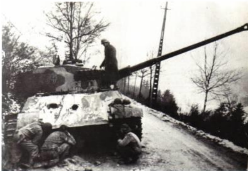
German King Tiger tank close to La Gleize