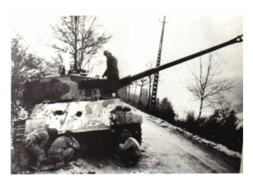
German King Tiger tank close to La Gleize