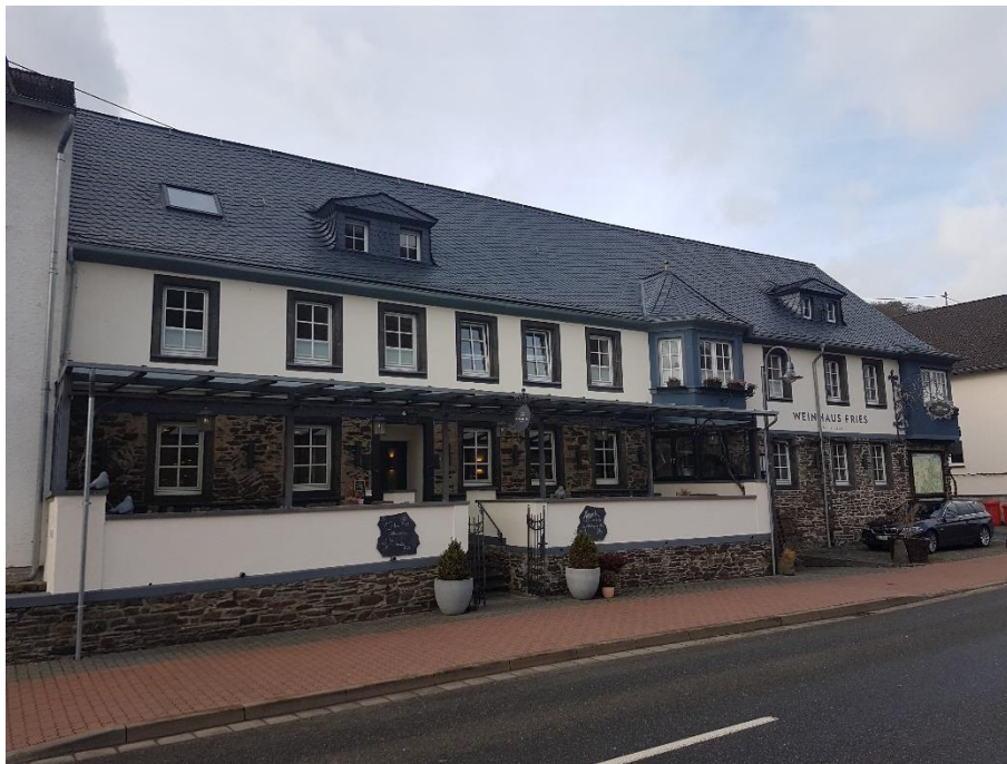
Weinhaus Fries in Löf-Kattenes