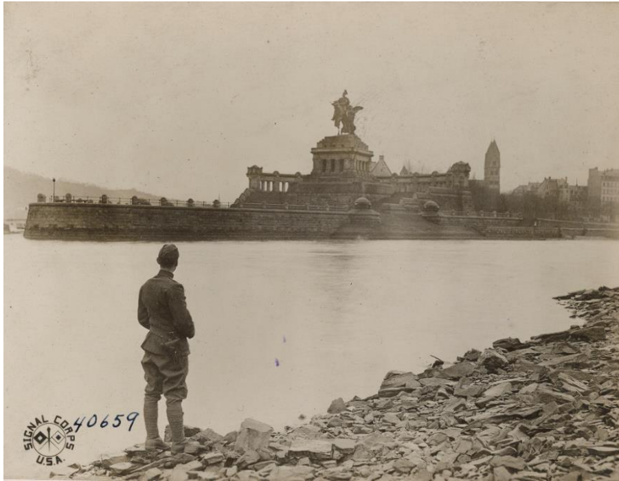
Signal Corps Photo #40659, showing an American sentry looking at the Statue of Wilhelm I at Deutsches Eck, Koblenz